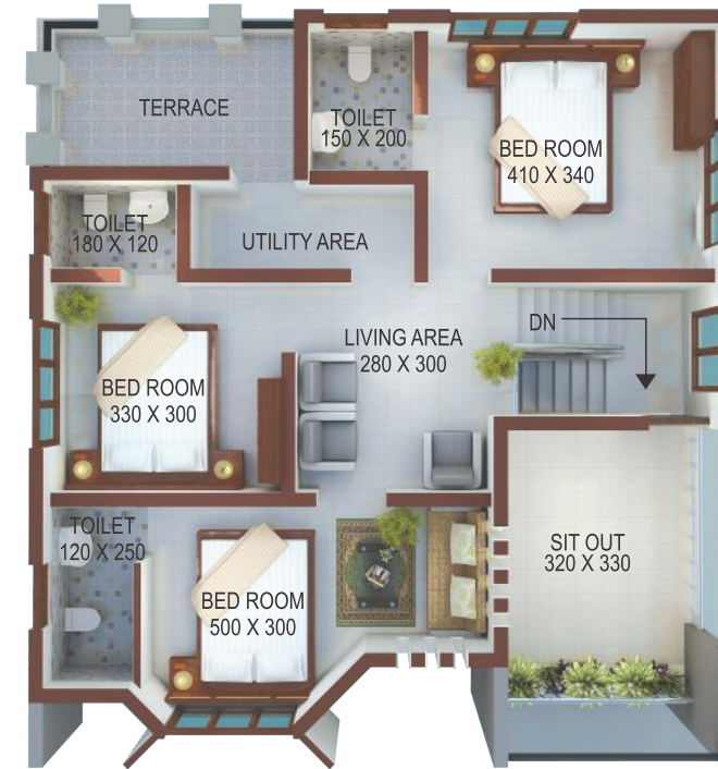
FIRST FLOOR PLAN Floor Area - 930 sft