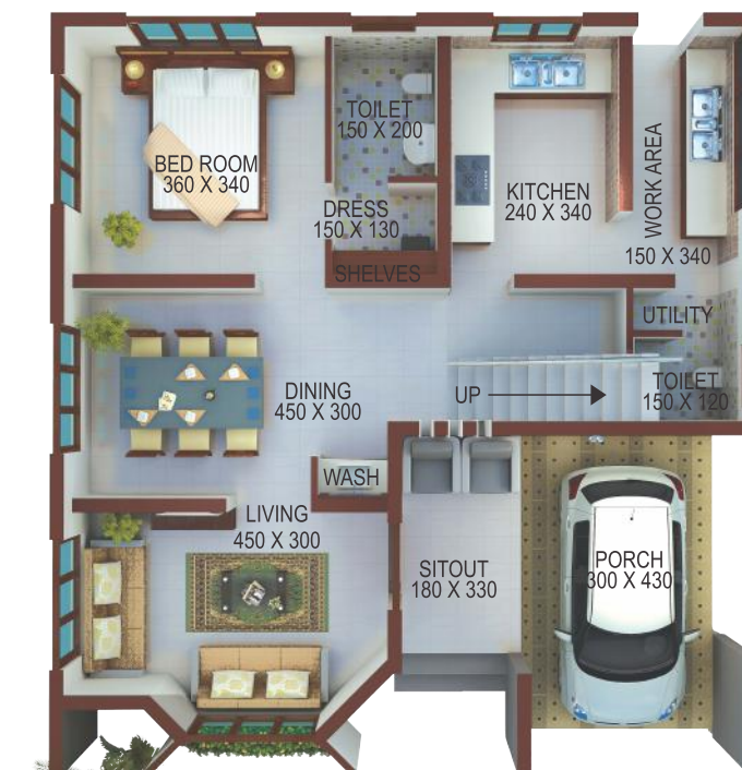
GROUND FLOOR PLAN Floor Area - 1067 sft (including porch)